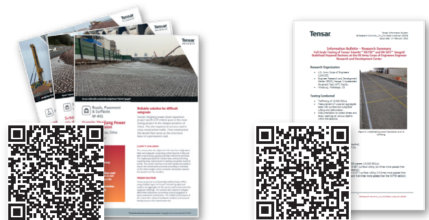
Tensar InterAx Success Stories

Scan the QR Codes for Success Stories & Get Your Copy of The Research Summary!